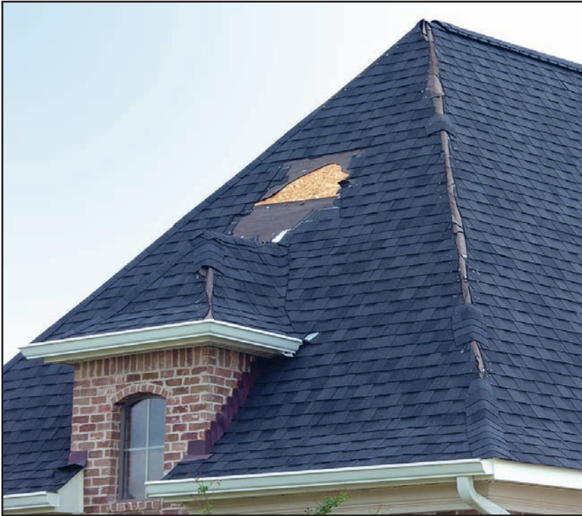
Figure 8-1. Instance where wind pressures exceeded the strength of the asphalt roofing.

Roof systems can also fail if roof-mounted equipment is damaged or dislodged by high winds. During Hurricane Katrina, loss of mechanical equipment caused the majority of water damage that was observed in several buildings. In some of those buildings, structural roof damage itself was quite minimal yet the buildings experienced extensive water damage.