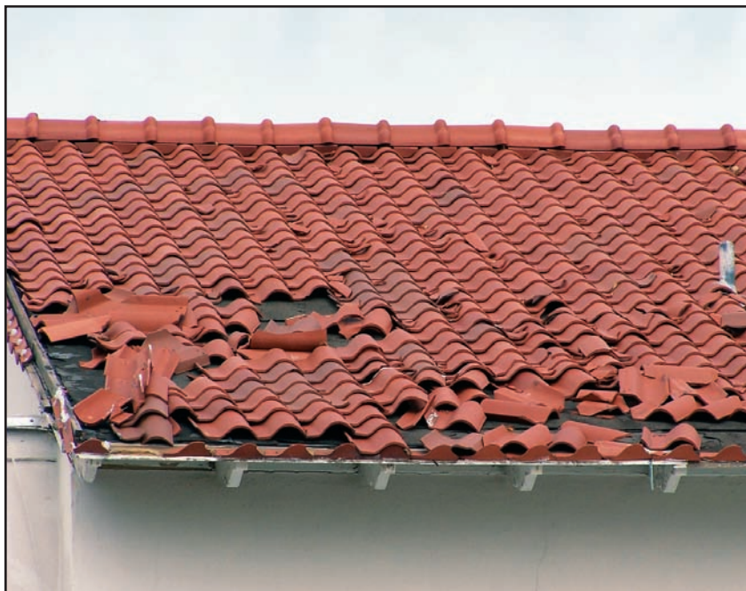
Figure 8-8. Clay tile roof failure. The tiles were dislodged due to inadequate anchorage.

FEMA (and other entities that have conducted post-disaster investigations since Hurricane Andrew struck Florida in 1992) have noted that tile roof coverings have not performed well during several high-wind events. Although performance of these roof covering systems has improved since Hurricane Andrew (due largely to better design and construction guidance from the manufacturers), roof covering systems still frequently fail during hurricanes. The performance of mortar-set tile roof systems continues to be very dependent upon the quality of the installation. This installation method has consistently been observed during MAT investigations to not perform as well as other tile installation methods. Tiles also remain vulnerable to being damaged by windborne debris because they are considered brittle coverings. When clay or concrete tiles are impacted by windborne debris, they commonly break and leave the underlayment exposed to high-wind forces it was not designed or constructed to resist (see Figures 8-8 and 8-9). This condition has been observed to lead to a progressive failure of the roof covering across the roof surface. Also, once damaged, it is important to note that the tile shards can become airborne, adding debris to the wind field. This debris may cause damage to the building itself as well as damage to downwind buildings.