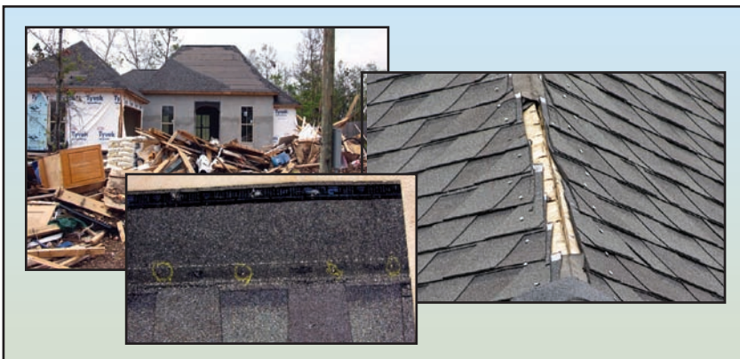
Figure 8-7. Loss of asphalt shingle roofing along hip. Best Practices approaches contained in Technical Fact Sheet No. 20 help prevent this mode of failure.