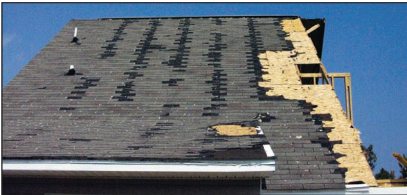
Figure 8-6. Roof failures that resulted from asphalt shingles being installed in a raking fashion.