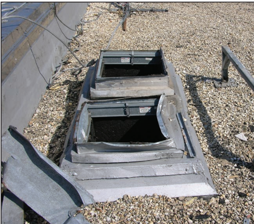
Figure 8-2. GULFPORT, MISSISSIPPI: Winds dislodged roof mounted equipment and created large openings in the roof system. (Source: FEMA 549)

Roof systems can also fail if roof-mounted equipment is damaged or dislodged by high winds. During Hurricane Katrina, loss of mechanical equipment caused the majority of water damage that was observed in several buildings. In some of those buildings, structural roof damage itself was quite minimal yet the buildings experienced extensive water damage.