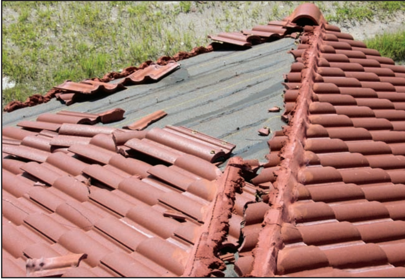
Figure 8-9. Storm damage to a tile roof system.

Wood Shingles and Shakes. Sections 905.7 and 905.8 contain the requirements for wood shingle and shake coverings. Roofing can be installed on solid or spaced sheathing, but solid sheathing is required where ice dams or low temperatures require an ice shield. Wood shake installations differ from wood shingle installations particularly in their underlayment and rake installations. Due to the irregular surface of wood shakes, an interlayment layer of 30-pound roofing felt is required to improve weather tightness. This interlayment layer is applied between each course.