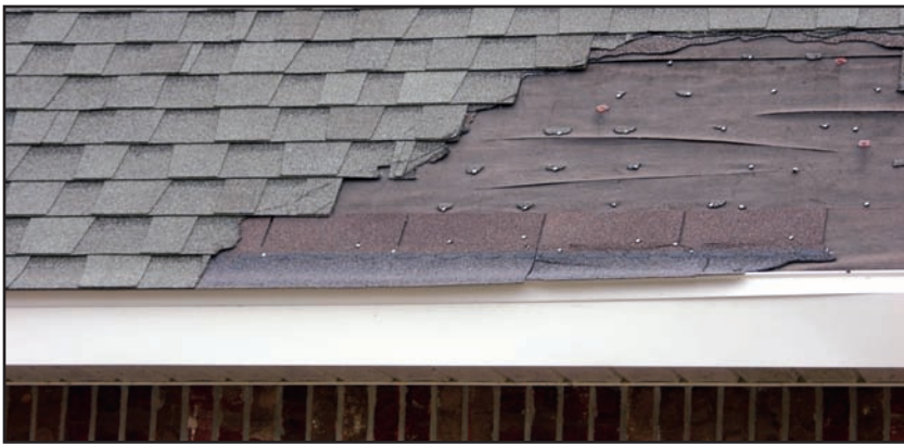
Figure 8-5. Roof failures that resulted from improper starter-strip installation.

FEMA 499, Technical Fact Sheet No. 20: Asphalt Shingle Roofing for High-Wind Regions , provides guidance on asphalt shingle installations. Many of the recommendations presented are similar to those described in the installation instructions provided by many manufacturers.